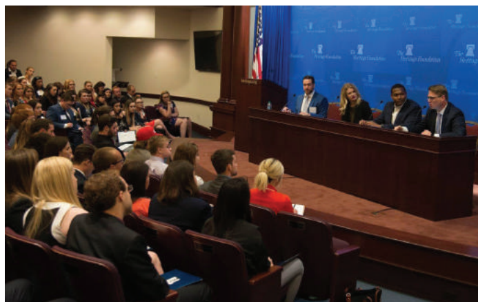
You introduced young professionals to AFF and The Heritage Foundation at Welcome to Washington in June. You hosted speakers from the Conservative Book Club, Charles Koch Institute, Leadership Institute, and The Heritage Foundation.

By supporting AFF, you are providing these young leaders with unique opportunities that will lead to lifelong and effective advocacy for liberty. Thank you for inspiring them to take the next step.