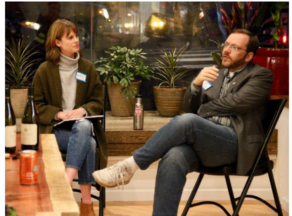
You're equipping Millennials with pivotal talking points, which will allow them to effectively articulate the message of freedom to their peers.